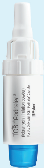
Not actual size

Cough is among the most common side effects of TOBI PODHALER but with the following information and tips, it can be managed effectively.