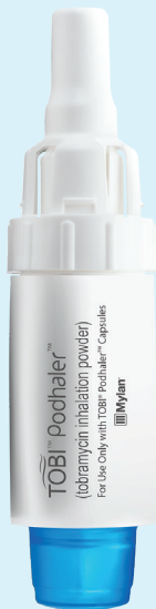
Cough events decrease over time with consistent use of TOBI Podhaler*

Cough is among the most common side effects of TOBI Podhaler but with the following information and tips, it can be managed effectively.